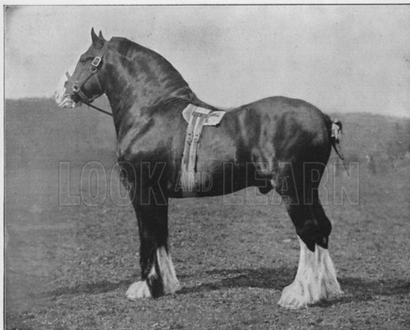
CLYDESDALE STALLION, "BARON'S PRIDE." "The greatest Clydesdale Sire that ever lived."