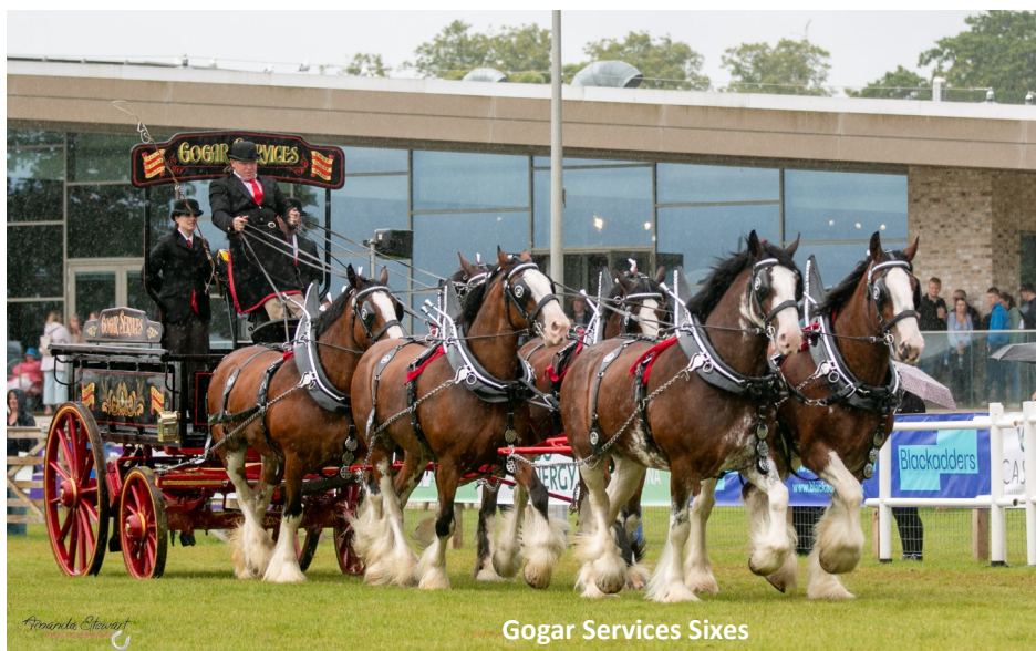
Gogar Services Sixes