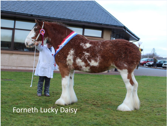
Forneth Lucky Daisy