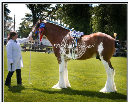
Royal Highland Show 2016 Reserve Champion Doura Geronimo