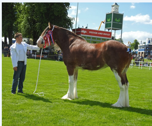
Royal Highland Show 2016 Overall Champion Macfin Diamond Queen